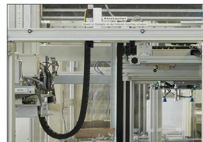
Flexible energy chain.