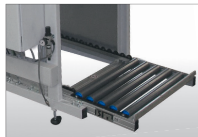
Discharge roller conveyor.