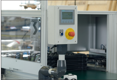
Rotatable control panel.