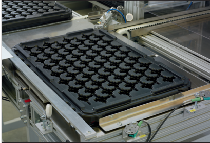
Filling position with pneumatic centering station.