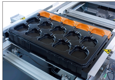
Filling position with centring.