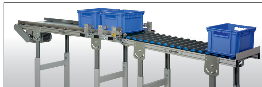
Stop position and centring.