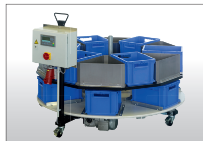
Rotary table with levels.