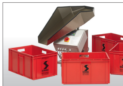
Functional scheme of distribution chute.