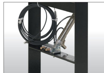
Pneumatic swivel device.