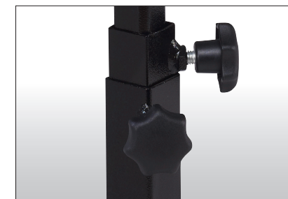
Infinitely variable height adjustment.