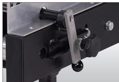
Simple adjustment of the separating gap.