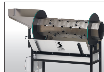
Adjustable perforated drum.