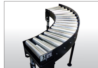
Curved roller conveyors.