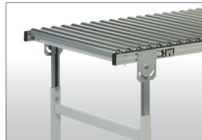
Roller conveyor designed with steel and stainless steel rollers.